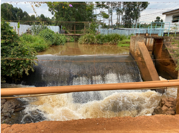
Intake weir of Oyugis Water Supply Project.

The multi-million Water Project that is set to inject 12 million litres of Water per day is expected to benefit over 60,000 residents and upon completion it will be handed to Homa Bay Water and Sanitation Company (HOMAWASCO).