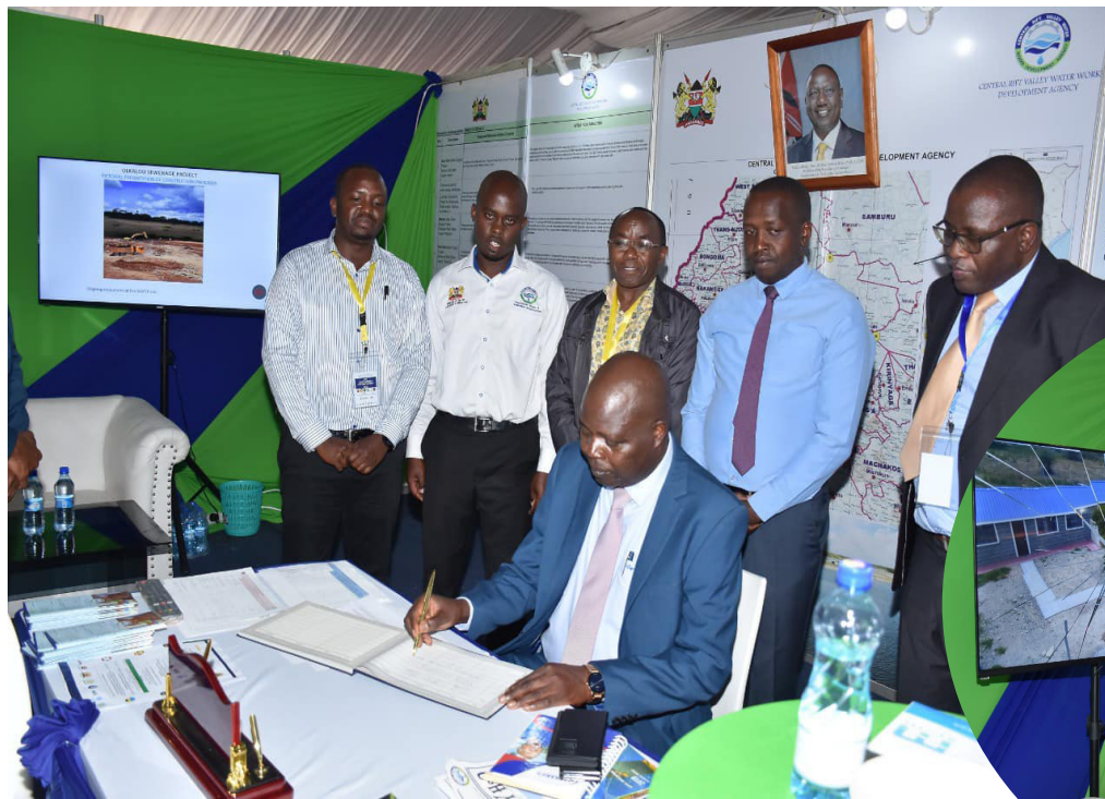
Water Secretary Eng. Sao Alima visits the Agency's exhibition booth during the opening of the Summit.

“Sustainable Water Resource & Sanitation Development for Socio-Economic Transformation” , was the theme for the 7th East Africa Water Summit.