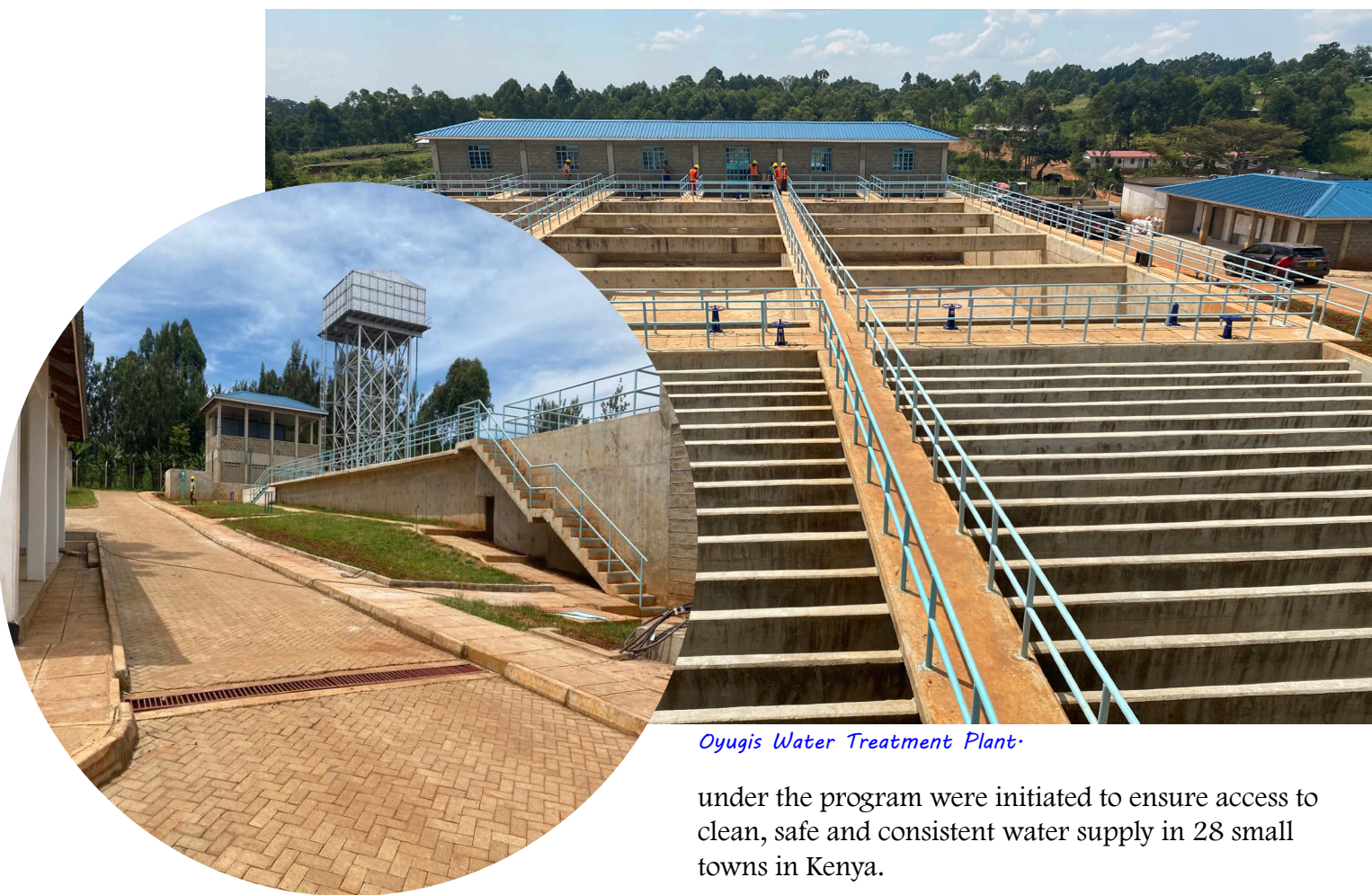
Oyugis Water Treatment Plant.

under the program were initiated to ensure access to clean, safe and consistent water supply in 28 small towns in Kenya.