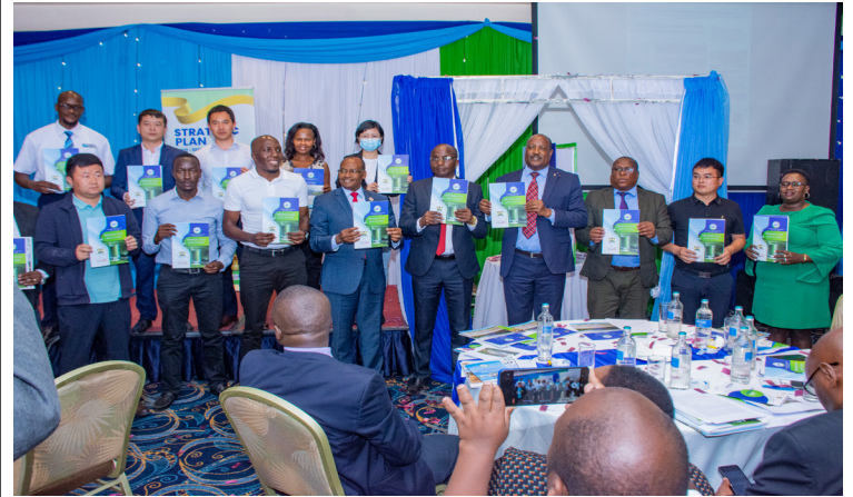
CRVWWDA's stakeholders display the strategic plan-