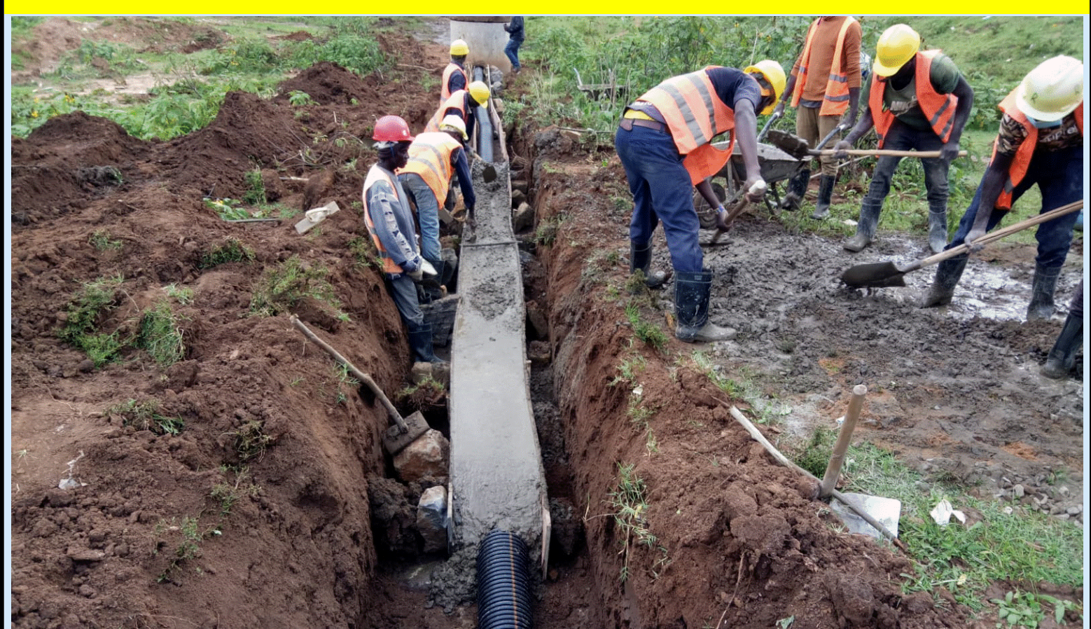
Haunching sewerline in Chepareria Hospital

entral Rift Valley Water Works Development Agency reports another milestone as the second of the flagship projects nears completion despite facing several challenges in its initial phase.