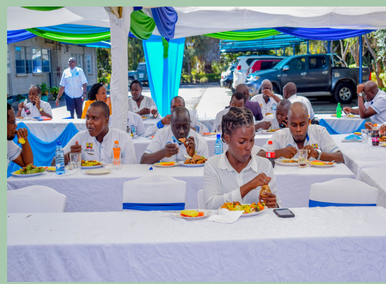
Staff of CRVWDA enjoy a sumptuous meal after an engaging meeting with the Board of Directors.