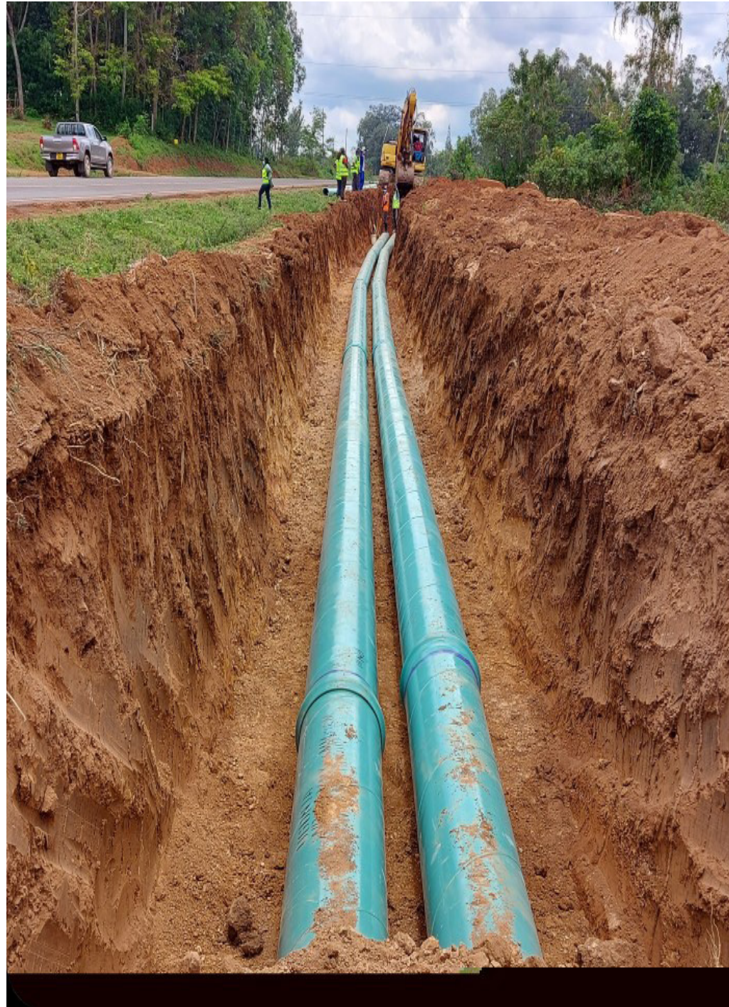
Laying of steel rising pipes