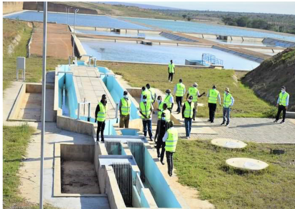
CRVWDA directors inspect the completion of narok town sewerage system