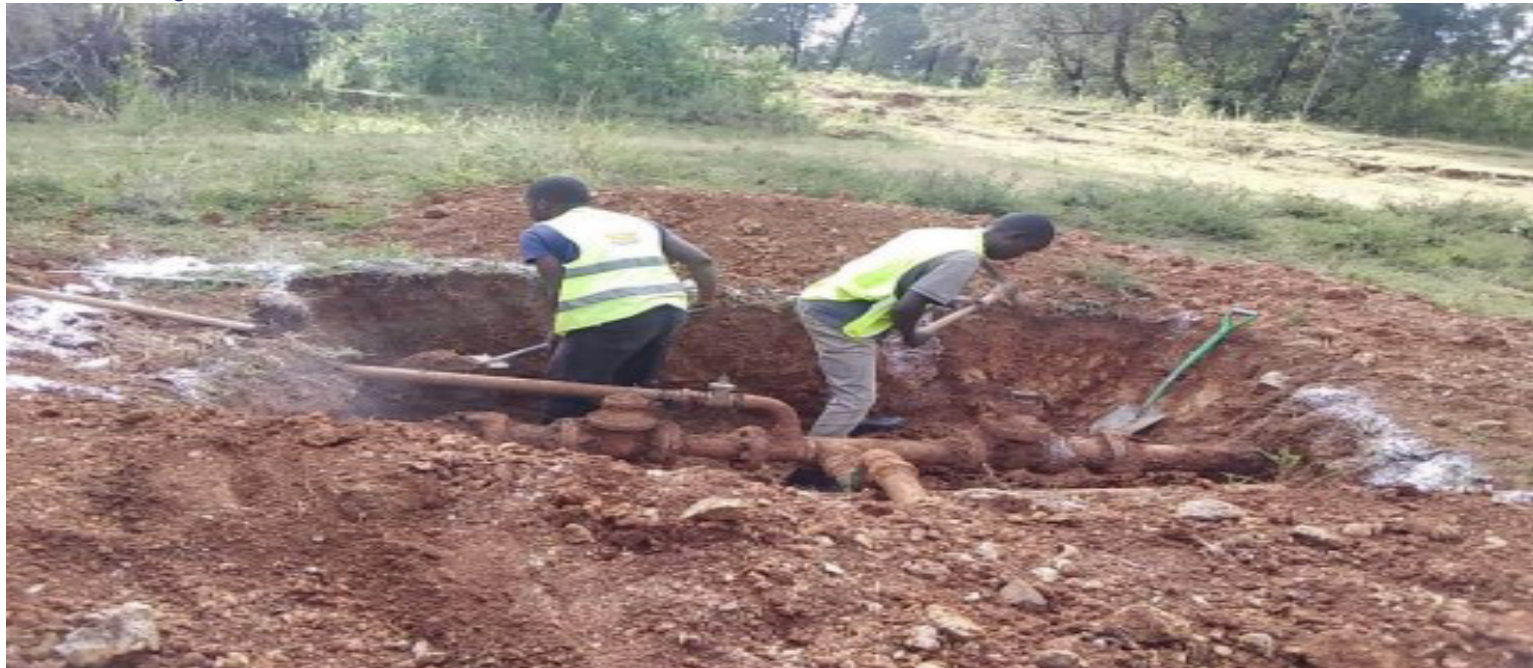
Exposing of existing water mains for rehabilitation.