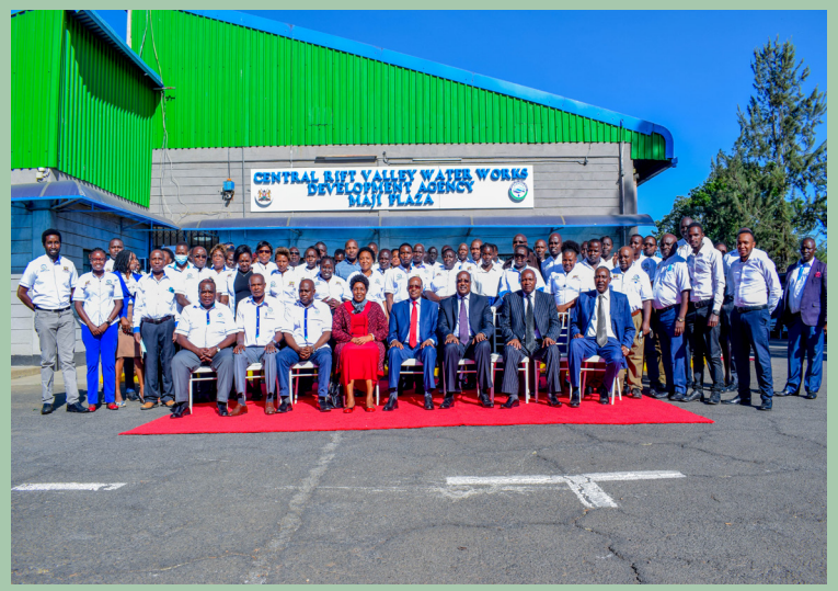
The Board of Directors, Management and Staff of CRVWDA.