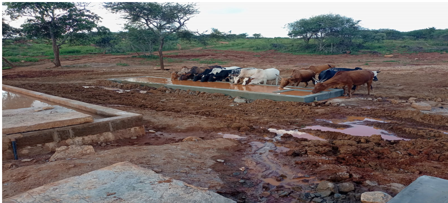
Livestock drink water from Cattle trough constructed downstream the dam.