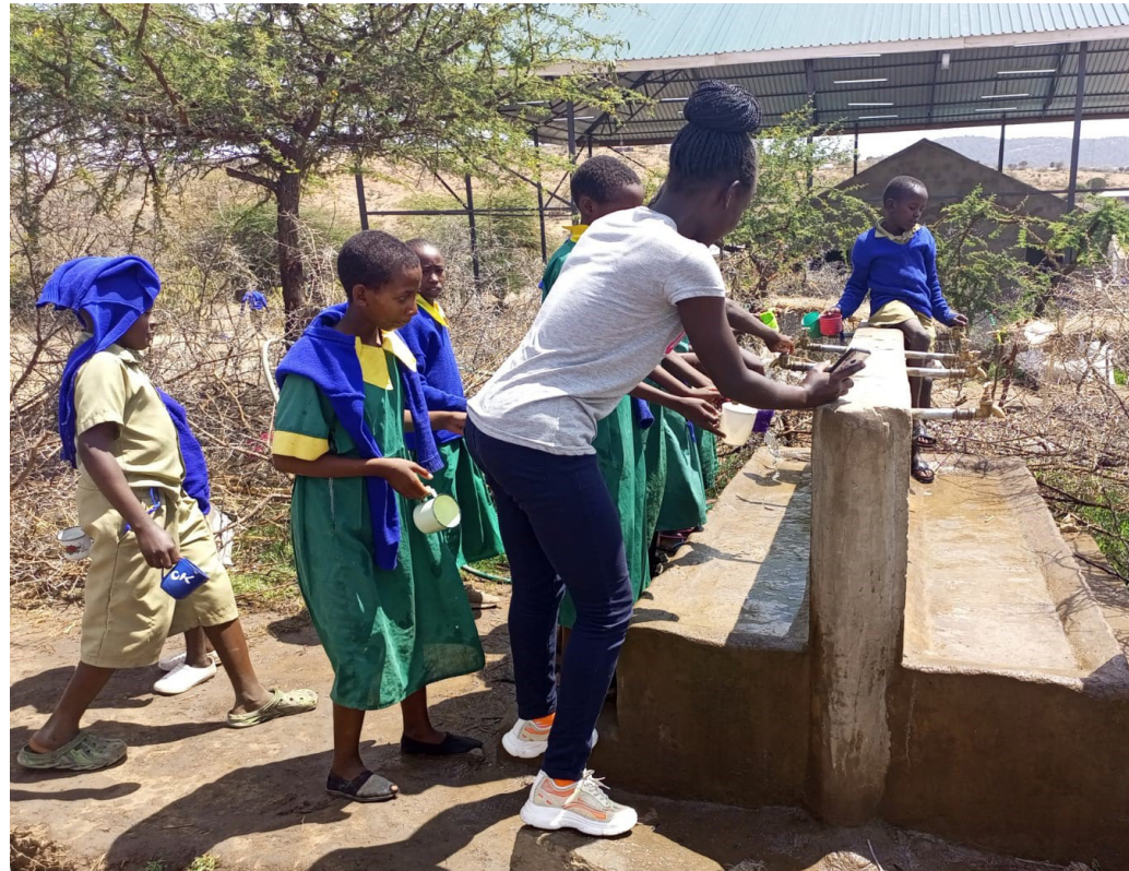
Doldol Primary School pupils enjoy running water from the borehole