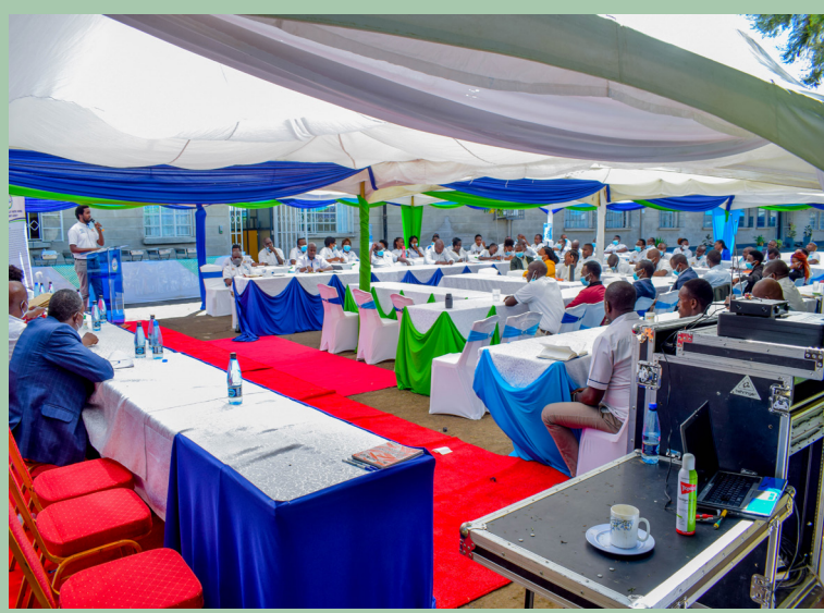
Members of staff of CRVWDA follow proceedings during the Board of Directors' meeting with staff.