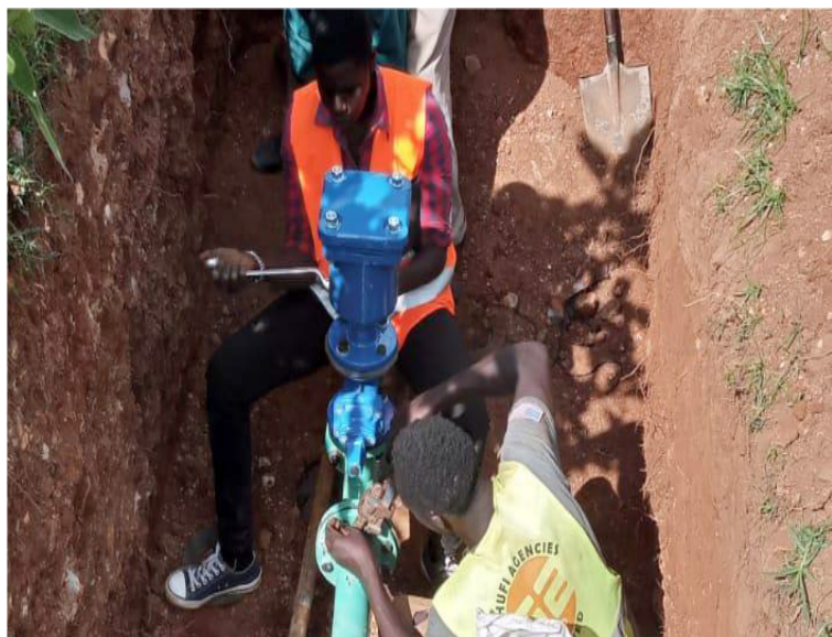
Installation of air valve along new water mains.

On completion of this noble project, the locals will have an opportunity to re-direct their efforts to economic generating activities and tending to their households. It will rekindle their hope knowing their lives will normalize with the provided solution to their water challenges that compelled them to walk for miles in search of the precious commodity.