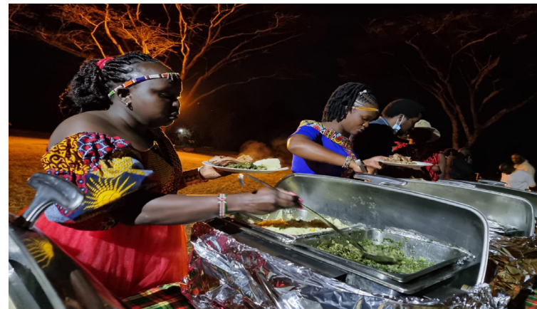
The Agency came together to reflect and celebrate milestones and achievements made in 2021