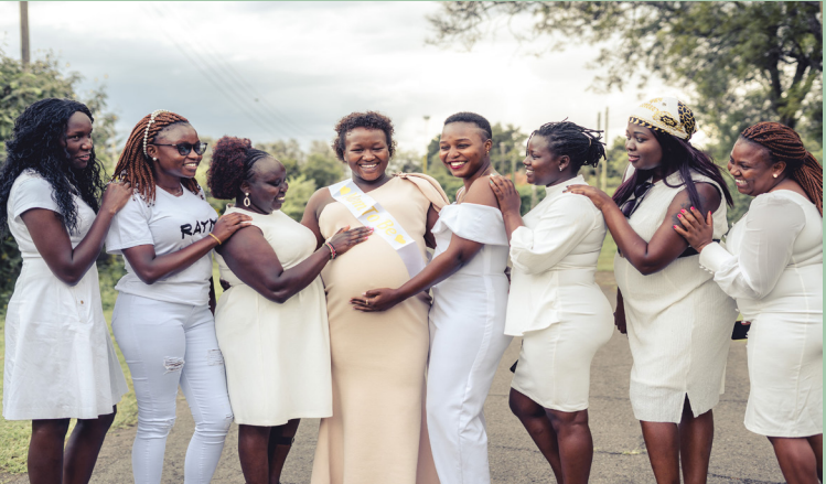
CRVWDA lady friends all joyous at Hulda's baby shower.