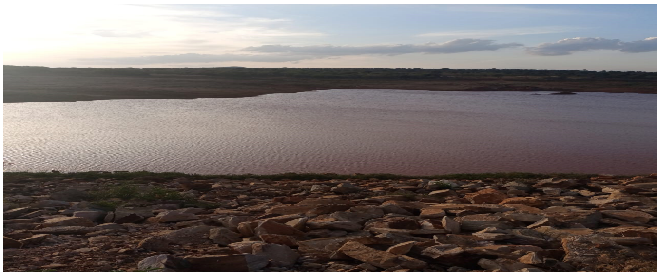
A section of Kasses Peace Dam on a rainy season.

The dam project was authorised by President Uhuru Kenyatta of Kenya and President Yoweri Museveni Of Uganda. A memorandum of understanding was signed and launched on September 12, 2019 in Moroto, Uganda.