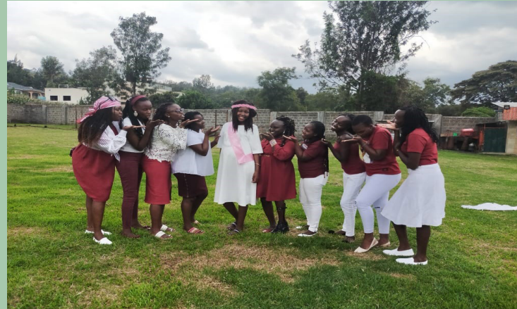
Faith's baby shower by CRVWDA lady colleagues