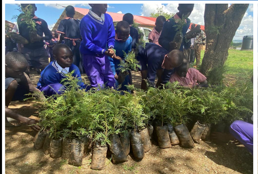
Pupils pick tree seedlings for planting.

RVWWDA partnered with the Women Enterprise 📭 Kipsogon Residents gather for a public sensitization on Fund and other water stakeholders to launch the Kipsogon Tree Planting Initiative on 5th May, 2023 in Mogotio Constituency, Baringo County.