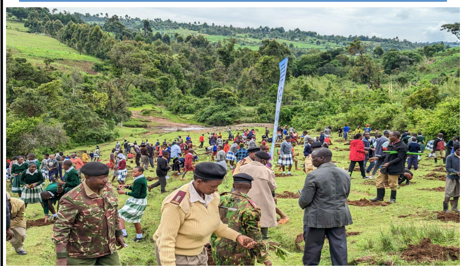
The Ministry of Water in conjunction with the Agency during the ministerial tree planting exercise at Kuresoi Itare Dam site.

entral Rift Valley Water Works Development Agency in conjuction with the Ministry of Water and other partners managed to mobilize and plant more than 10,000 indigenous tree seedlings in Itare Dam site in Kuresoi, Nakuru County on 15th June, 2023.