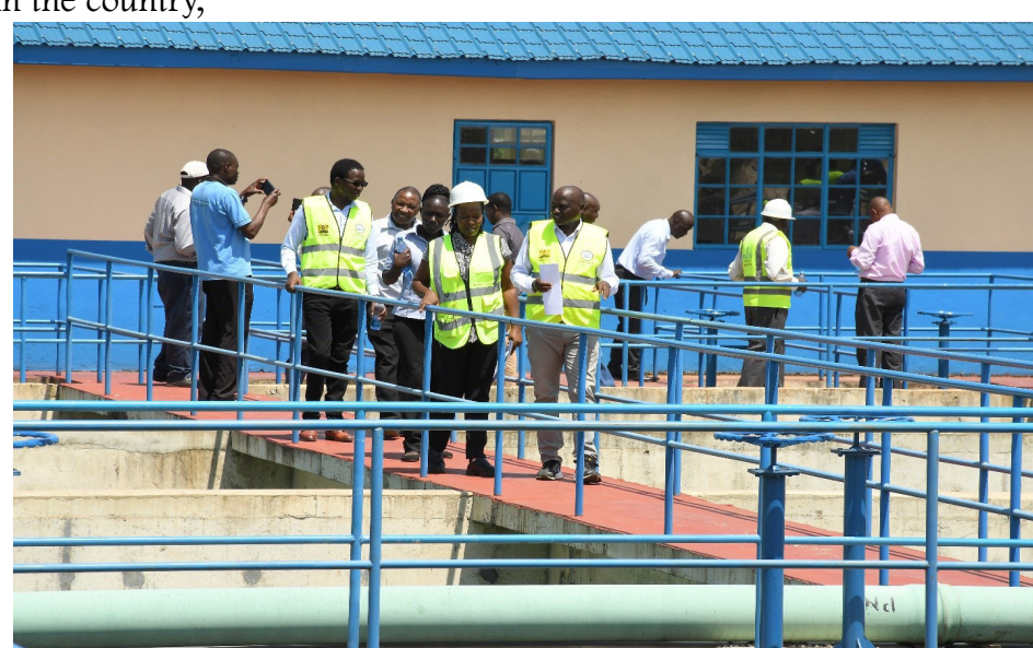
Inspection of Ugunja WaterSupply Project, Treatmeant Works.

Businesses. In Kenya, both the public and private investments are aware that improved water management and reliable access to water is good for local and national