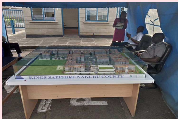
Kings Sapphire Ltd. showcase designs of their upcoming homes that are up for sale in Nakuru County to Agency's staff