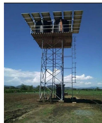
Kuresoi health centre borehole Elevated tank tower

The agency has adopted and utilized durable yet affordable and sustainable energy sources like solar energy and hydropower to pump water to higher grounds thus providing flood control, irrigation support and clean drinking water.