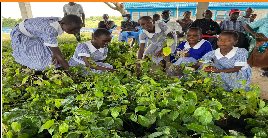
Areka Pri- Sch. pupils join CRVWDA staff in planting tress at Ugunja -Sega -Ukwala Water Supply Project Ttreatment plant.

With the integration of tree planting into the performance contract, the Agency's mission to plant 30,000 trees draws life in financial year 2021-2022. The initiative looks forward to adding forest cover as a measure to conserve water bodies and preserve the environment.