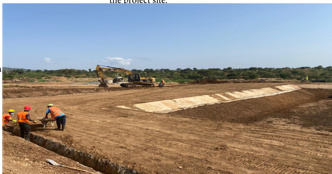
A section of Chepareria Town Sewerage

In conclusion of the Three-day supervision mission, the AfDB delegation applauded CRVWWDA on the nearly completed Chepareria Town Sewerage project in West Pokot County. This project is meant to serve over 13,000 residents with over 400 new customer connections. The project becomes the second among many projects under this programme to be nearly completed within a stipulated time. The team also carried out a tree planting exercise at the project site.