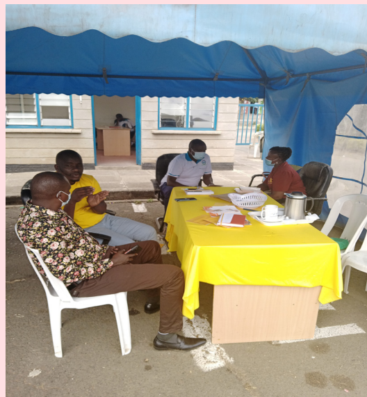
The Agency's staff get insights on financial management courtesy of CIC Group in a marketing event held in the Agency.