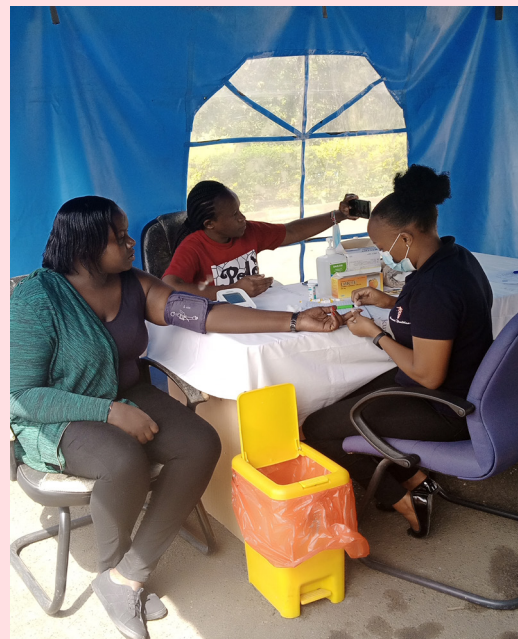
CRVWDA staff receive general medical check up during a marketing event held at the Agency by Equity Afia healthcare on 10th June 2022.