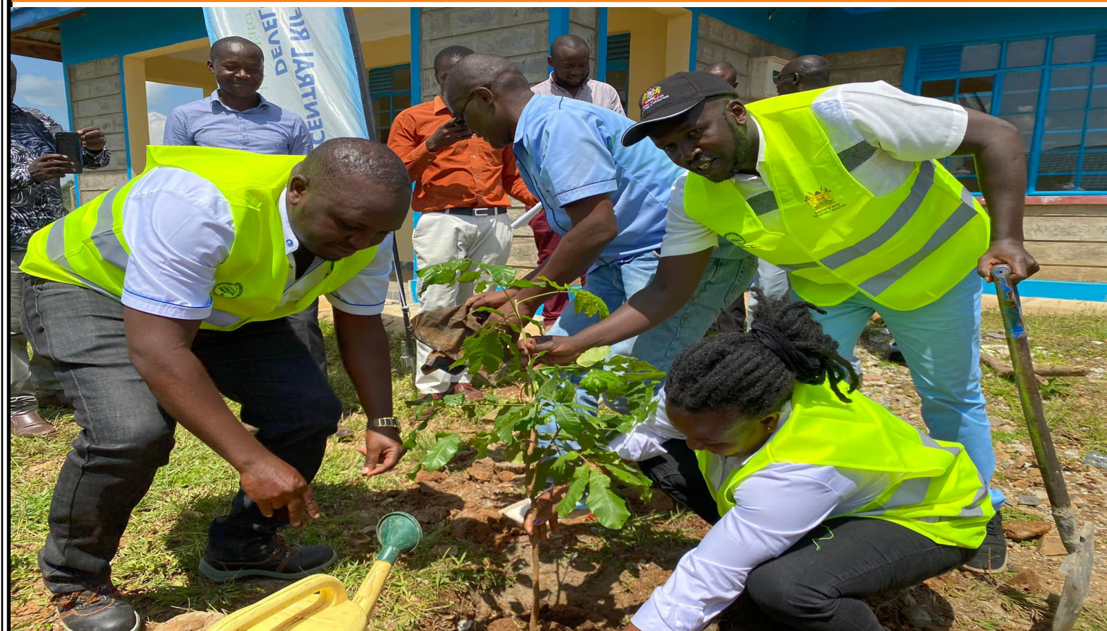
Agency's staff plant trees at the Ugunja-Sega-Ukwala Water Supply Project Treatment Plant on 6th June.

In 1898, a renowned Russian playwright and short story writer Anton Chekhov said, "A tree is beautiful, but what's more, it has a right to life; like water, the sun and the stars, it is essential. Life on earth is unconceivable without trees." Climate influences people's character so to wildlife. Forests create climate thus, beyond individual, corporate or local goals, growing trees contributes much to climate targets.