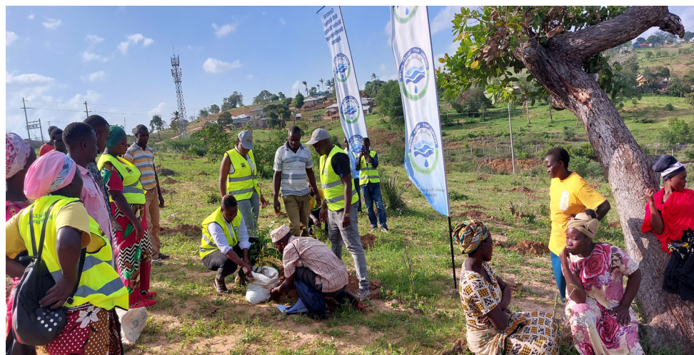
CRVWDA staff plant trees at Mwache, Kwale County on 10th May

Currently, Kenya's forest cover stands at 7.2% according to the latest report by the Ministry of Environment and Forestry. The coverage is 2.8% shy from the 10% required by GOK by 2022. Thereby, as directed by the constitutional commitment that was signed in 2018, the Government seeks to deeply indulge in reforestation and afforestation.