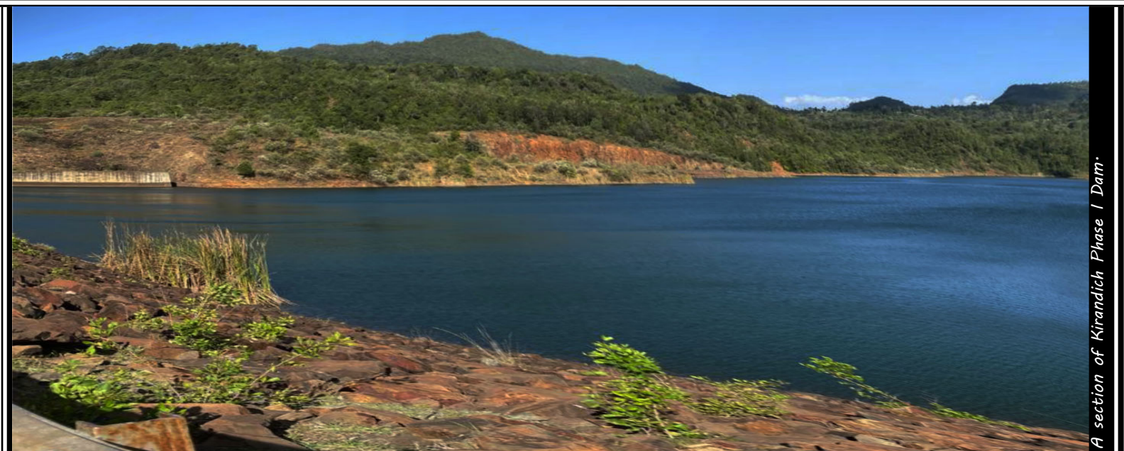
A section of Kirandich Phase I Dam.